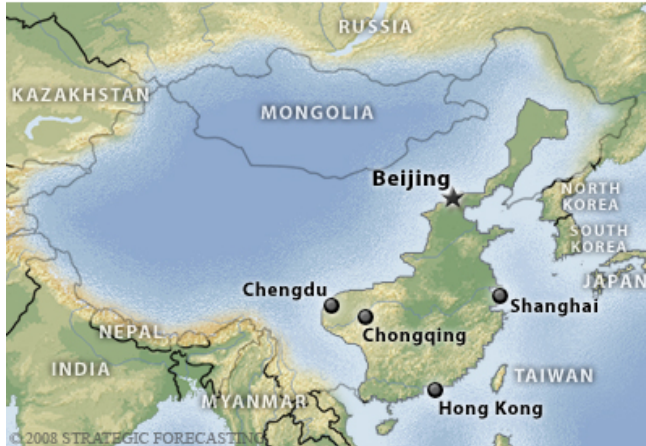
CHINA AS AN ISLAND

Internally, China must be divided into two parts: the Chinese heartland and the non-Chinese buffer regions surrounding it. There is a line in China called the 15-inch isohyet, east of which more than 15 inches of rain fall each year and west of which the annual rainfall is less. The vast majority of Chinese live east and south of this line, in the region known as Han China -- the Chinese heartland. The region is home to the ethnic Han, whom the world regards as the Chinese. It is